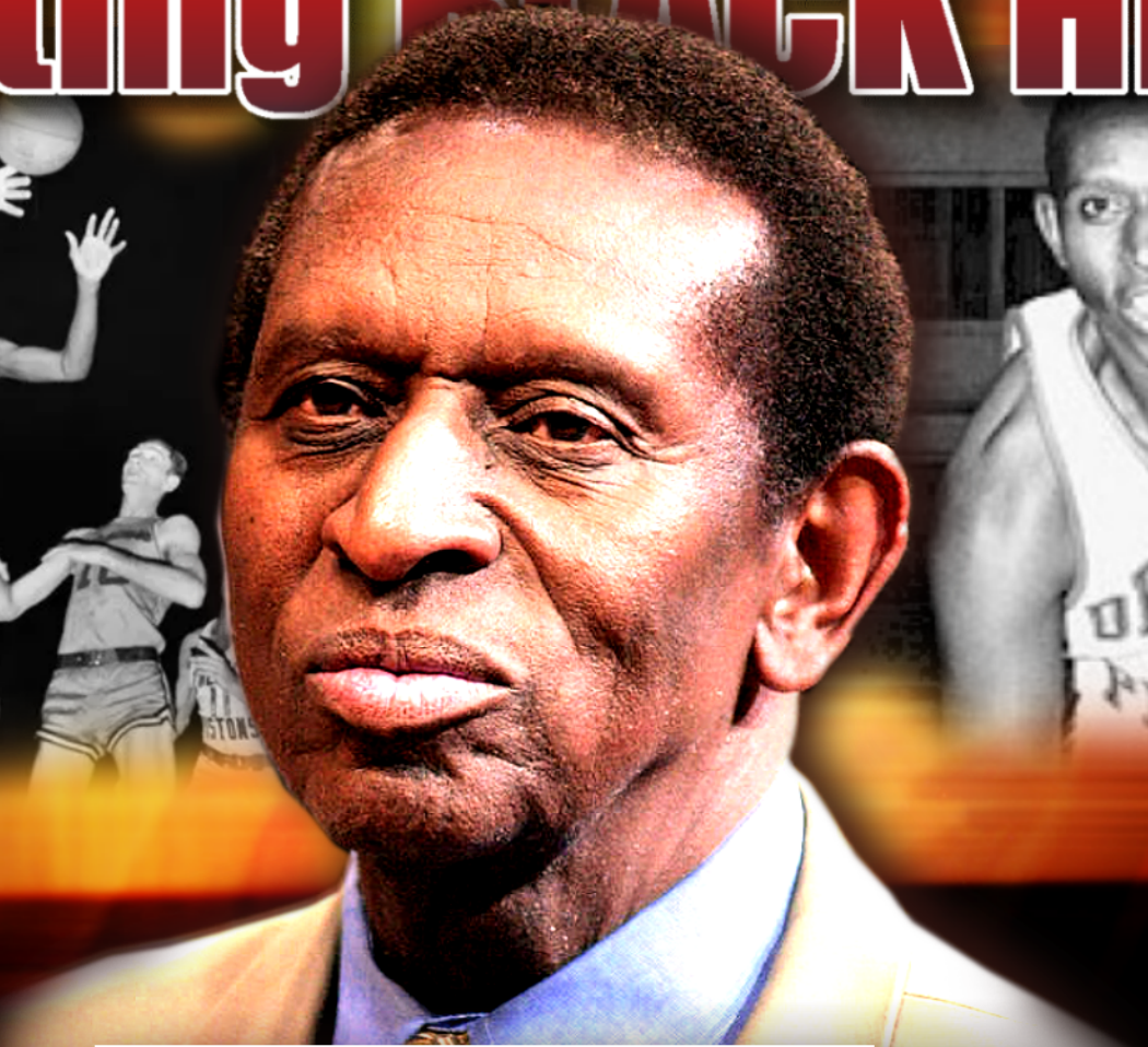
EARL LLOYD 1928 - 2015